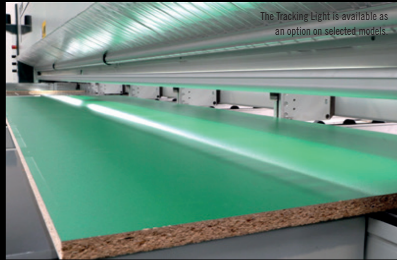
The Tracking Light is available as an option on selected models.