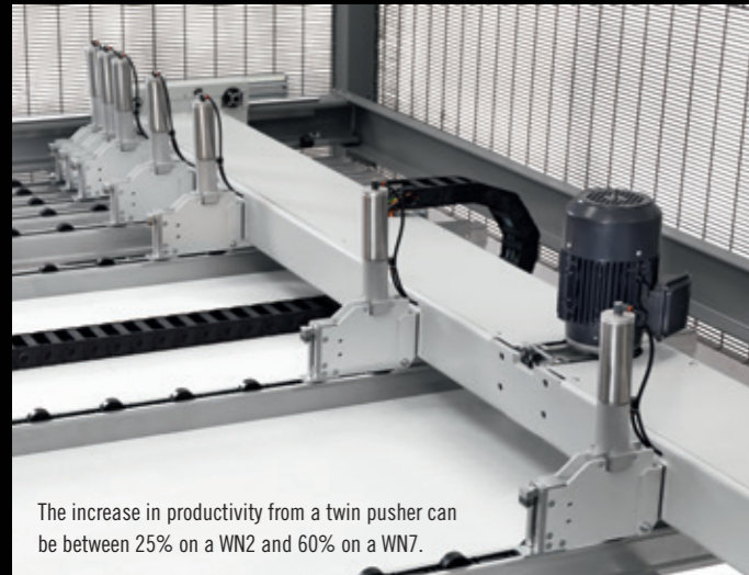
The increase in productivity from a twin pusher can be between 25% on a WN2 and 60% on a WN7.