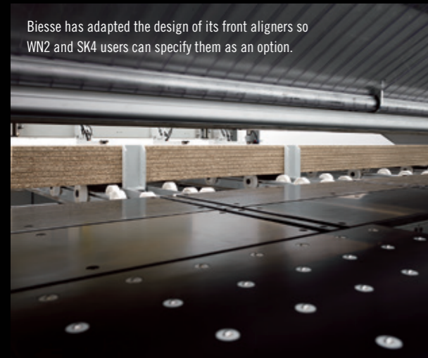
Biesse has adapted the design of its front aligners so WN2 and SK4 users can specify them as an option.