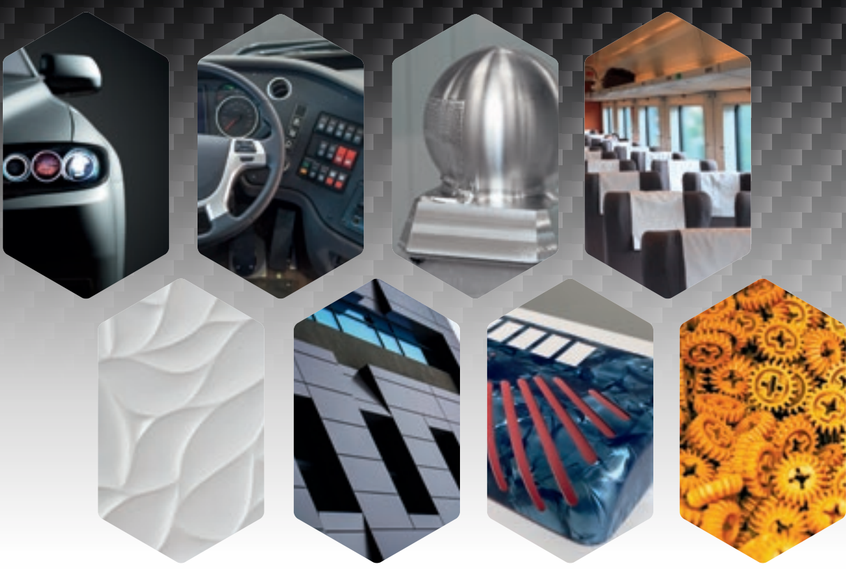
VEHICLES CONDITIONING/COLD ROOM